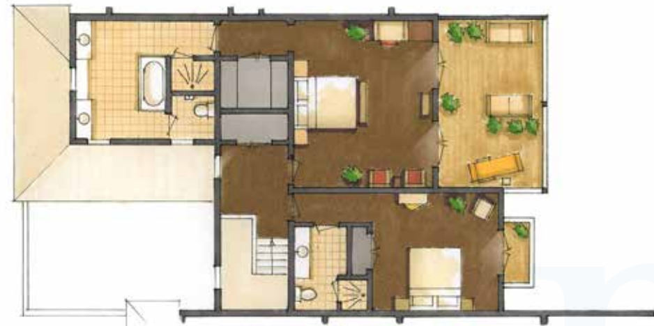
First Floor Upper Level